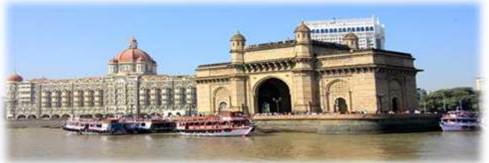
Taj Hotel & Gateway of India