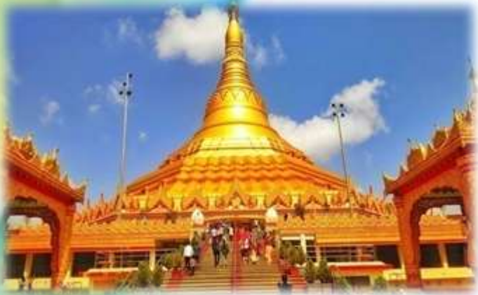
Golden Vipassana Pagoda

Mumbai is known for its pulsating nightlife, recreation zones and lively hangouts. Marine drive, Nariman point, Hanging Gardens, Siddhi Vinayak Temple, Gateway of India, Mahalaxmi Temple, Golden Pagoda, Kanheri Caves and seashores of Juhu and Chowpatty are worth visiting.